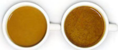
Lactorich Blis C4